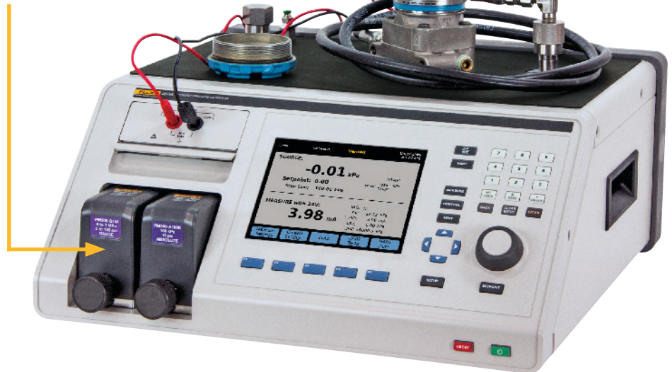
Use the 2271A to perform closed loop, fully automated calibration on 4-20 mA devices like this transmitter.

Install up to two pressure modules in the 2271A chassis at one time.