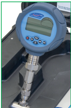
A high pressure swivel connection with quick connector allows the Additel gauge to be connected and positioned at whichever angle is most convenient for the operator.