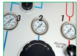
The three pressure gauges indicate: 1. pressure in bottle 2. pressure set by pressure regulator 3. pressure at test port