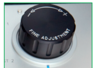
The Minerva MNR 90 precision volume adjuster allows very fine pressure control up to within 100 Pa