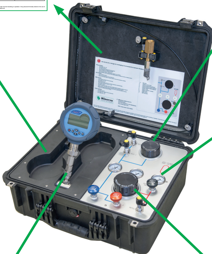
Space to store extra pressure gauge