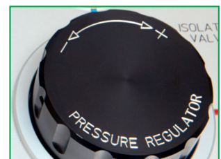
The Minerva MNR 180 pressure regulator is designed specifically for use in calibration and test applications