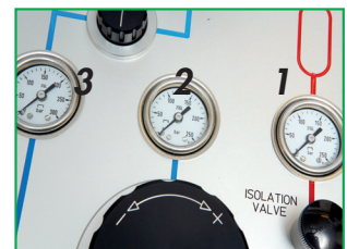
The three pressure gauges indicate: 1. pressure in bottle 2. pressure set by pressure regulator 3. pressure at test port