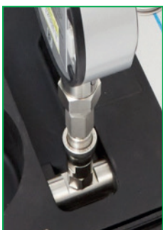
A high pressure swivel connection with quick connector allows the XP2i and M1 gauge to be connected and positioned at whichever angle is most convenient for the operator.