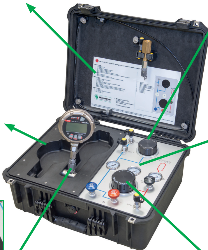
Space to store extra pressure gauge