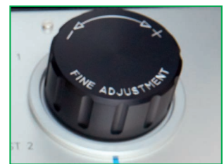
The Minerva MNR 90 precision volume adjuster allows very fine pressure control up to within 100 Pa