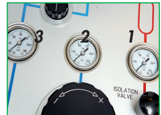
The three pressure gauges indicate: 1. pressure in bottle 2. pressure set by pressure regulator 3. pressure at test port

Are you using the High Pressure Case in situations that require an IS calibrator? Then choose the IEC/ATEX certified case, especially designed and certified for controlling conditions in an explosive atmosphere.