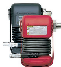
The Fluke pressure module can be placed here during transport