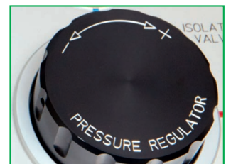
The Minerva MNR 180 pressure regulator is designed specifically for use in calibration and test applications