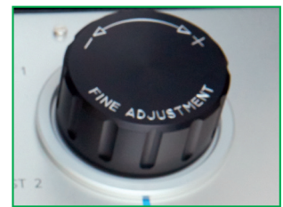
The Minerva MNR 90 precision volume adjuster allows very fine pressure control up to within 100 Pa