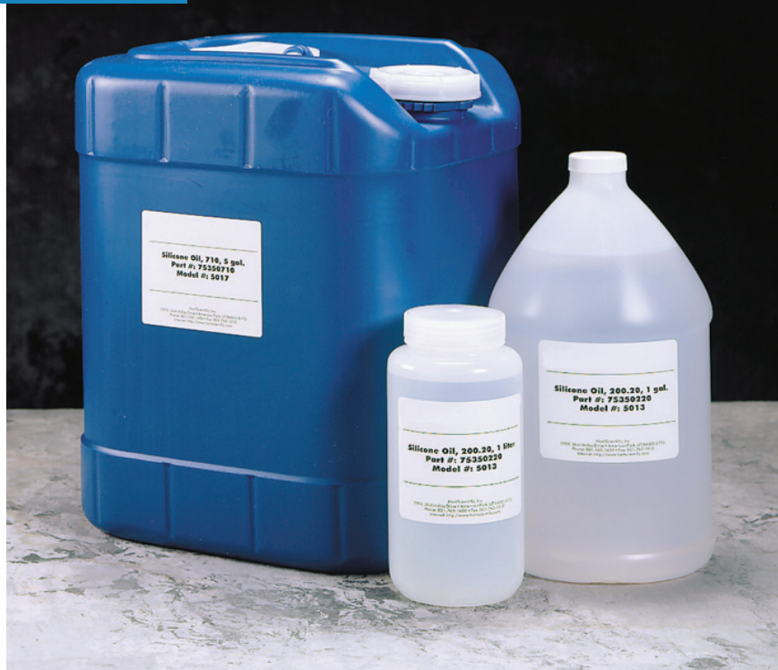
Fluke Calibration offers a wide variety of bath fluids in different container sizes.

Viscosity is a measure of a fluid's resistance to flow—we often think of it simply as "thickness." Kinematic viscosity is the ratio of absolute viscosity to density and is measured in "stokes" (at a specific temperature), which are commonly divided by 100 to give us more helpful "centistokes." The higher the number of centistokes, the more viscous (or thick) a fluid is. Viscosity is always stated at a specific temperature (often at 25 °C) and increases as the fluid's temperature decreases (and vice versa).