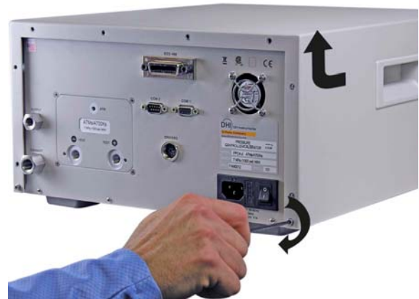
Figure 1: Removing the PPC4 Chassis Cover

Insert a 6 mm diameter round screwdriver into the hole marked "Release Tab" on the feet and pry inward. The feet will snap off (See Figure 2).