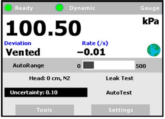
PPC4E displays real-time measurement uncertainty at each pressure.

Uncertainty of the measured or delivered pressure is calculated and displayed continuously by PPC4E. The calculation uses uncertainty components based on PPC4E specifications and the component values can be tailored by the user.