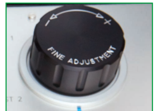
The Minerva MNR 90 precision volume adjuster allows very fine pressure control up to within 100 Pa