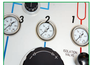
The three pressure gauges indicate: 1. pressure in bottle 2. pressure set by pressure regulator 3. pressure at test port