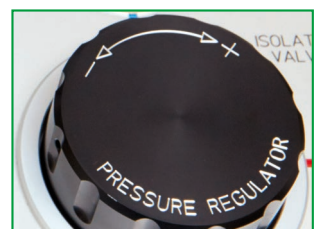
The Minerva MNR 180 pressure regulator is designed specifically for use in calibration and test applications

The mold to seat the calibrator accommodates the DPI 620 multi-calibrator shown above. The tight fit ensures a stable setting and yet easy removal. The DPI 620 displays the pressure set at the test ports using the MNR controls. Original GE parts are used to connect the pressure module and DPI 620 both electronically and pneumatically ensuring full compatibility.