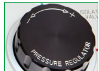
The Minerva MNR 180 pressure regulator is designed specifically for use in calibration and test applications

A high pressure swivel connection with quick connector allows the Additel gauge to be connected and positioned at whichever angle is most convenient for the operator.