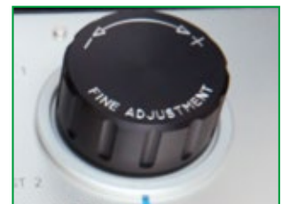
The Minerva MNR 90 precision volume adjuster allows very fine pressure control up to within 100 Pa