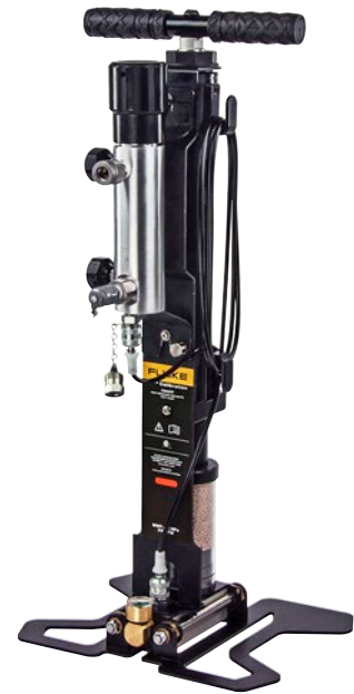
Figure 1. The Fluke Calibration 700HPPK Pneumatic Test Pump

Gas custody transfer flow computers that calculate flow by measuring the differential pressure across a flow restriction, such as an orifice plate or other differential pressure flow device, require special calibration to perform at optimum accuracy. In custody transfer applications where the buying and selling of commodities like natural gas is involved, calibration checks are performed frequently as a matter of fiduciary responsibility. For the purpose of this application note, the use of gas custody transfer flow computers in the natural gas transmission industry is referenced. Flow computers need multiple measurements to calibrate each device. In the normal application, three measurements are made: volumetric flow, static (line) pressure and temperature. A calculation is performed using this data to determine the actual mass of the gas flowing through the pipeline.